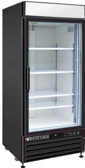
MXM1-16RB (Color: Black)

Glass Door merchandisers are designed for durability and visual appeal in promoting your product. Glass door merchandisers are energy efficient and effective at keeping product at exactly the right temperature. This keeps food fresher for longer. The simple-to-use but precise digital controls allows for easy temperature adjusting and flexible use of the unit.